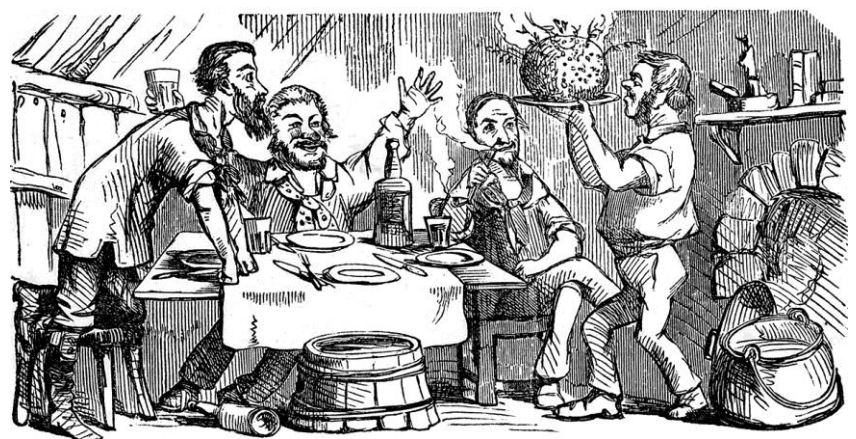
CHRISTMAS PUDDING IN THE BUSH.

And we won't go till we've got some, (three times) So bring some out here. Good tidings etc